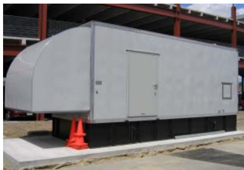
1 Megawatt Generator